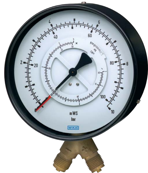
Differential Pressure Gauge Model 711.11